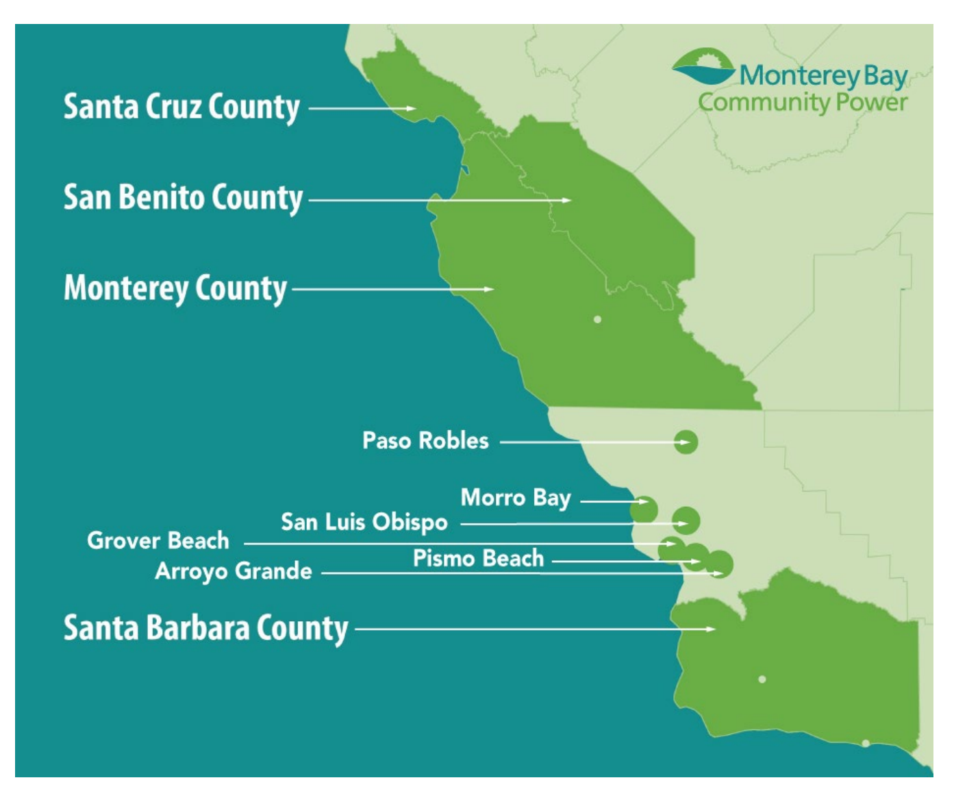
Figure 1: MBCP Service Area Map