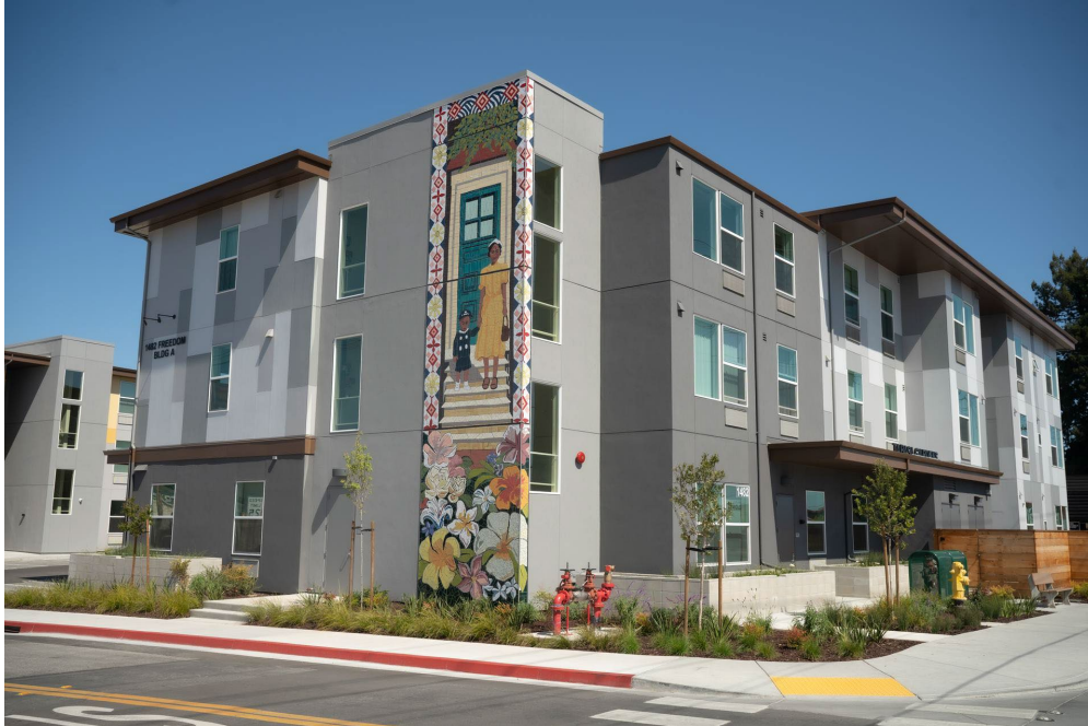
The new Tabasa Gardens housing development in Watsonville, one of several all-electric affordable housing projects funded in part by 3CE.

Central Coast Community Energy (3CE) continued to make great strides in 2024, weathering a challenging energy market while pursuing new renewable generation projects, funding new affordable housing for the Central Coast, and expanding our energy program offerings to help customers take control of their energy use.