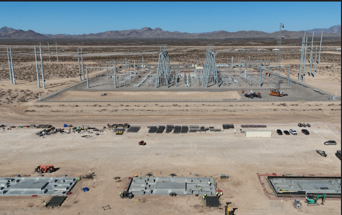
The Atlas solar project will deliver 100 MW of renewable energy to 3CE customers

Willow Rock Energy Storage Center Kern County, CA Battery storage is essential for California’s transition to carbon-free energy. Willow Rock Energy Storage isn’t your typical battery; instead of lithium, it uses compressed air to generate power. By supporting projects like this, 3CE customers are contributing to revolutionary innovation.