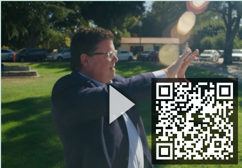
Scan QR codes to access these powerful videos

Letting customers define value – sharing the cost to power sustainable businesses and communities