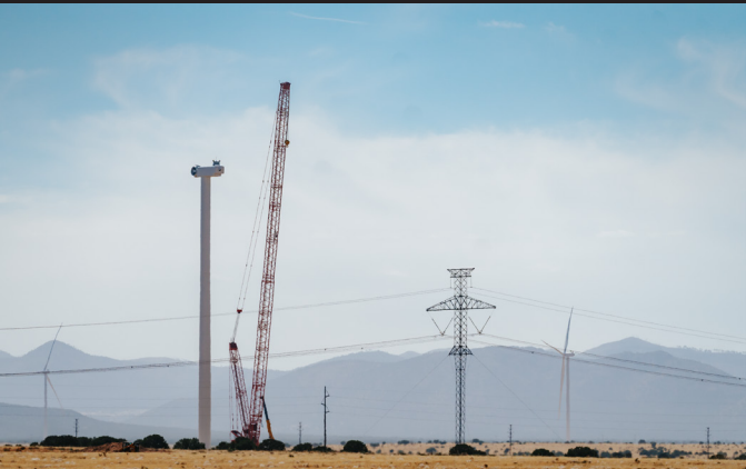
The SunZia wind project will deliver 205 MW of renewable energy to 3CE customers